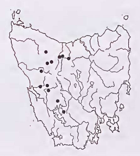
Figure 2. Distribution of Xeroclarysum collierianum as known from herbarium specimens.

Distribution & Ecology: Xerochrysum collierianum is endemic to western and north-western Tasmania from St Valentines Peak in the north to the Ragged Range in the south (Fig. 2). It typically occurs on the open, rocky summits and ridge-tops of the Ordovician conglomerate and some quartzite mountains. These are old, very low-nutrient, siliceous rocks that support a suite of plants adapted to extremely oligotrophic sites. This plant usually grows in cracks and crevices in the rocks, in full sun, where few other flowering plants can survive. Occasional plants, growing in the shade, are taller than average and have leaves that are broader (up to 18 mm) and more rounded at the apex, e.g. Collier 5178.